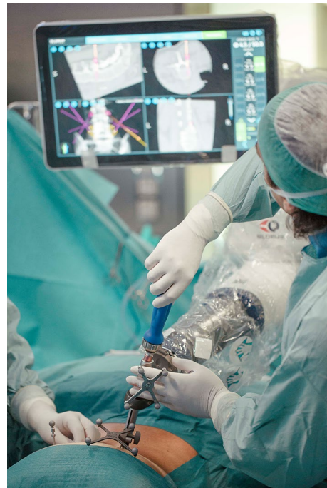
Fig. 1 Screw insertion with the robotic positioning system.

The surgical technique employed in this study utilized a robotic positioning system (ExcelsiusGPS ® , Globus Medical, Inc., Audubon, PA, USA) (Fig. 1) in which patient radiographs may be uploaded and registered through one of three modalities: preoperative CT, intraoperative CT, or fluoroscopy. For this study, only the preoperative CT workflow was used. In this workflow, a CT scan is taken prior to the surgery, and screw placement planning can be performed. In the operating room (OR), fluoroscopy is used to “merge” the CT and plan to the patient’s positioning on the surgical table. The robotic system uses a dynamic reference base and positioning camera to track the position of instrumentation in real time and