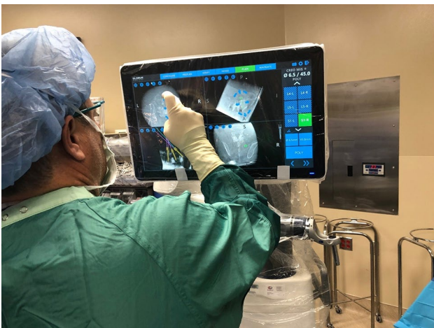
Fig. 1 Screw planning with the robotic positioning system

In intraoperative CT mode, the image coordinate system was obtained from a portable intraoperative CT (e.g., O-arm, Medtronic SNT, Louisville, CO, USA) or standard CT scan was taken at the time of surgery, with the patient already in position on the OR table. Spinal levels were identified and a CT scan was taken. Pedicle screw trajectories were planned and saved.