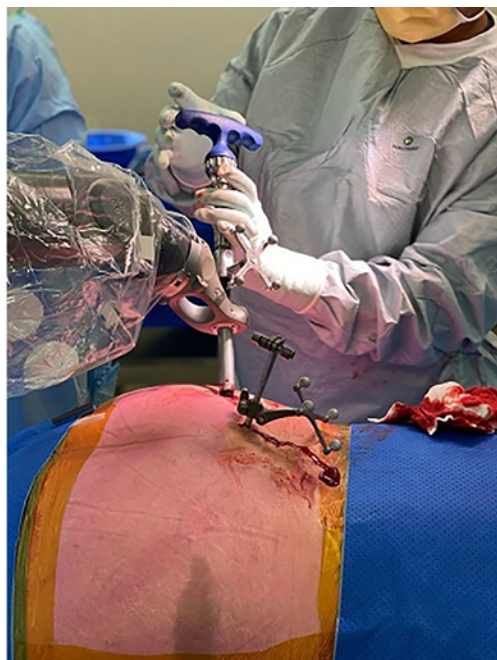
FIG. 3. Intraoperative photograph showing the navigated high-speed drill keeping the navigation interface trajectory.

keeping to the trajectory, using the navigation interface (Fig. 3). The most common pattern used 2 screws across the SIJ. The length and diameter of each implant were estimated based on navigated projections. The screws were placed using preplanned trajectories on the CT scan navigation interface of the robot. Convenient direct placement of screws was possible through the incision after drilling and tapping through the rigid robot guidance arm. Fixation was provided using cannulated screws (SI-LOK SIJ fixation system) filled with allograft and autograft bone from drilling. All incisions were closed in standard fashion. In the postoperative period, patients were allowed immediate weight-bearing and mobilization, as tolerated.