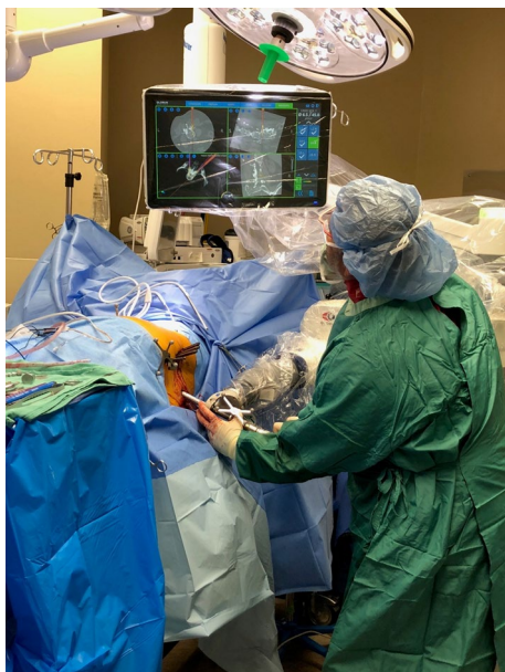
Fig. 3 Minimally invasive lumbosacral pedicle screw placement with a navigated robot-assisted positioning system