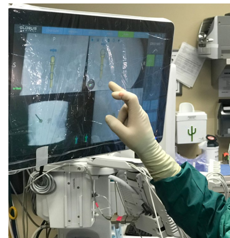
Fig. 2 Intraoperative pedicle screw placement planning

appropriate size was manually inserted. Rods were then placed in a standard fashion, with the patient remaining in the lateral position. Locking caps were set once the rods were in their proper position.