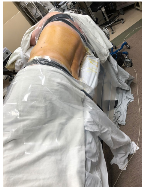
Fig. 1 Patient positioning for SP-LLIF

Following pedicle screw placement, lumbar interbody fusion was performed using the lateral approach. The endplates were prepared and an interbody spacer of