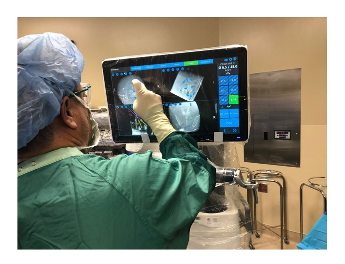
Fig. 1 Screw planning with the robotic positioning system

In intraoperative CT mode, the image coordinate system was obtained from a portable intraoperative CT (e.g., O-arm, Medtronic SNT, Louisville, CO, USA) or standard CT scan was taken at the time of surgery, with the patient already in position on the OR table. Spinal levels were identified and a CT scan was taken. Pedicle screw trajectories were planned and saved.